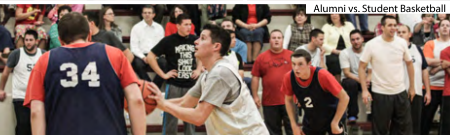
Alumni vs. Student Basketball