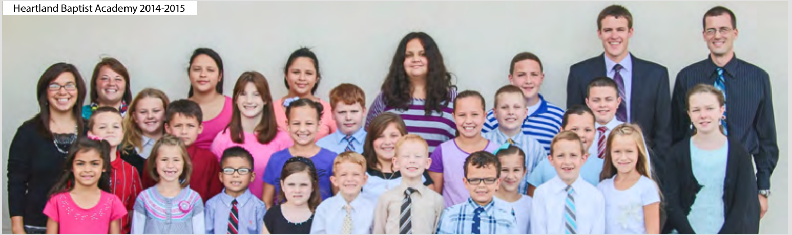
Heartland Baptist Academy 2014-2015